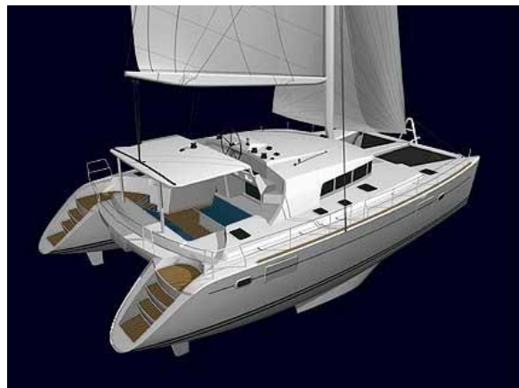
Manufacturer Provided Image: Above