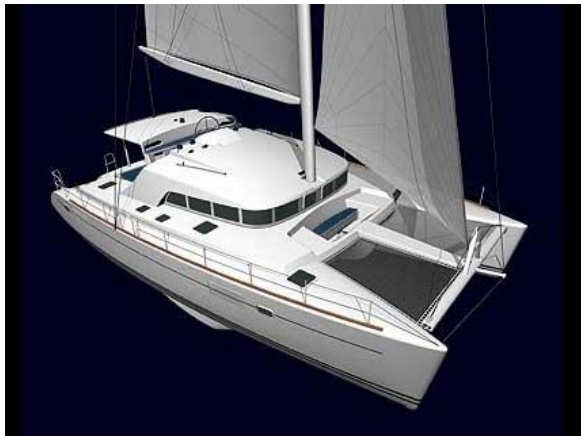
Manufacturer Provided Image: Front