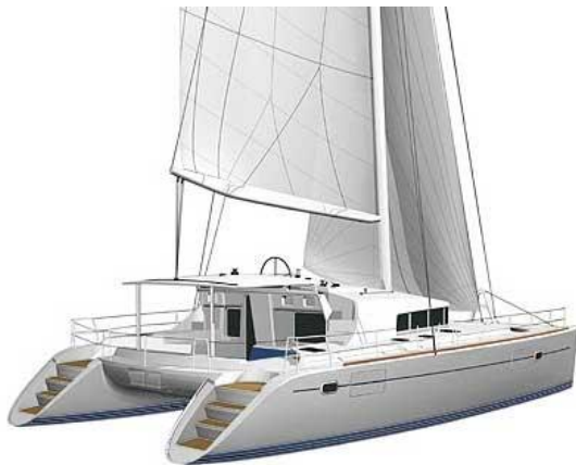
Manufacturer Provided Image: Aft