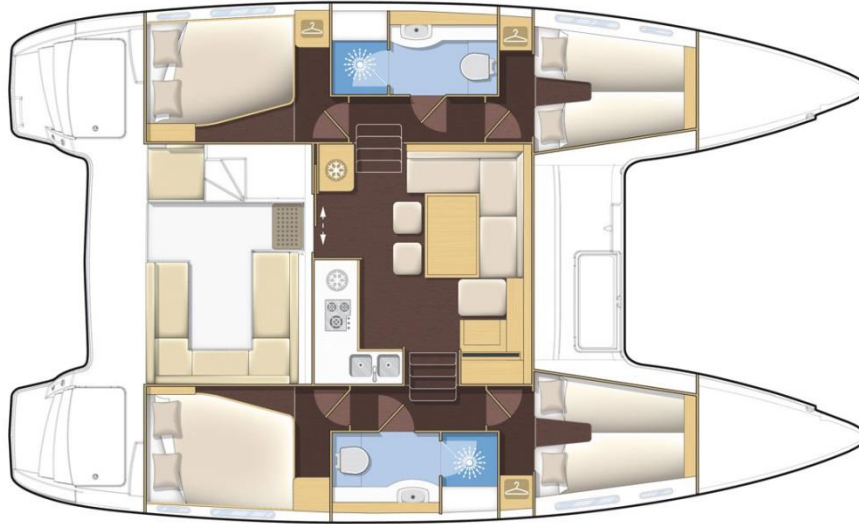
4 cabines 2 SDB / 4 cabin 2 bathrooms