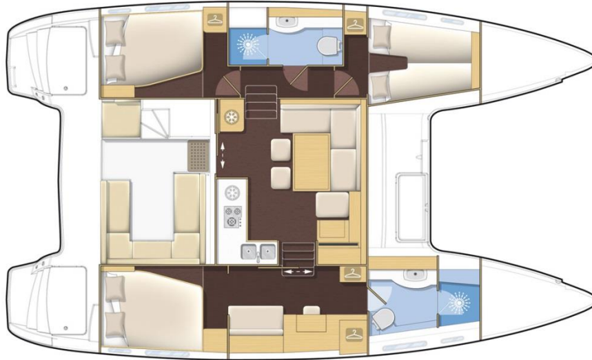
3 cabines 2 SDB / 3 cabin 2 bathrooms