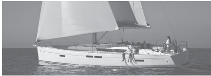
Sun Odyssey 469