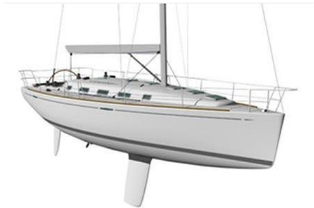
First 44.7