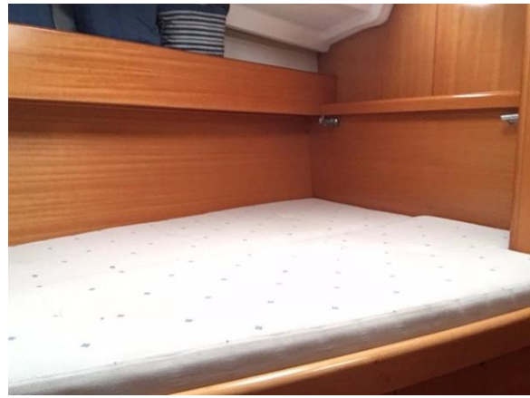
Pullman owner cabin