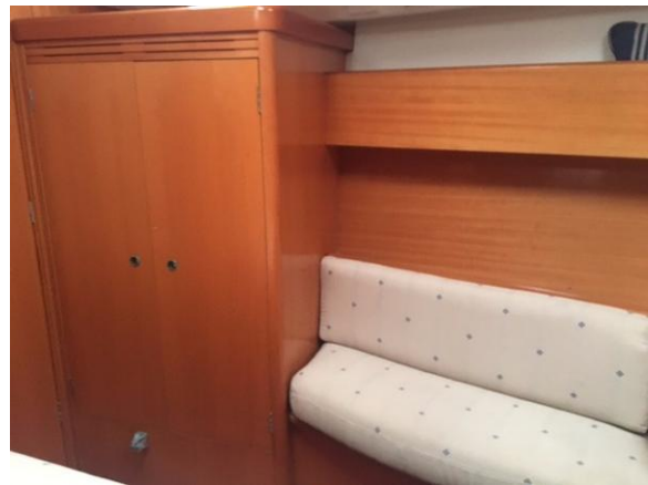
Settee Owner Cabin